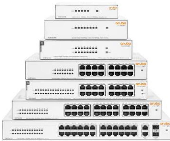
Aruba Instant On 1430 Switch Series Family

The Aruba Instant On 1430 Switch Series includes seven switches in PoE and non-PoE configurations: one (1) 5-port, two (2) 8-port, two (2) 16-port, one (1) 24-port, and one (1) 26-port model with 2 SFP uplinks models. With the PoE models, you get up to 30W PoE per port power delivery for Class 4 PoE devices like access points, surveillance cameras and VoIP phones. The 8-port and 16-port PoE models come with the power budget of 64W and 124W respectively to support the latest IoT devices. All switches are fan-less, making them ideal for acoustically sensitive areas, and unmanaged requiring no configuration (not managed by Aruba Instant On management).